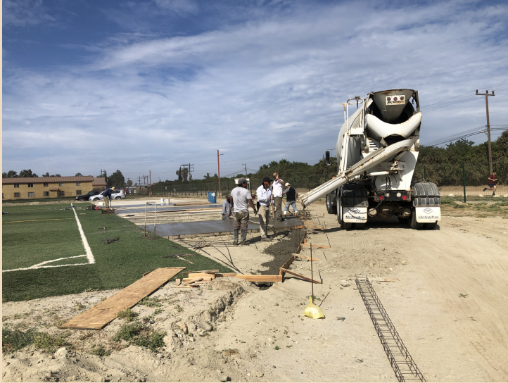
Cement being poured around the perimeter of the soccer field at FFHM in Mexico.

Thank you again to all of our school community for your generosity!